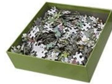
Custom frameless puzzle