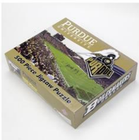
Paper packaging customization