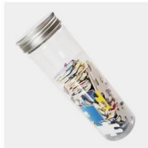
Custom plastic jar packaging